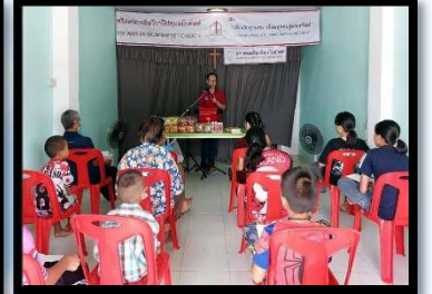
MV Wapi Pathum