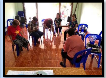
MV Amnat Charoen