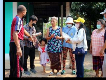
MV Nong Khai Church

Isaan is Thailand's largest region. This region has 20 provinces with a population of about 22 million people. North-east Thailand is one of the most unreached areas in the country. Less than 0.1% of the population in this region profess faith in Christ. There are so few Christians because it's hard for people to overcome the influence of Buddhist beliefs in the community. It's their norm. People go to temples and their activities revolve around 'religion.' Isaan is rich in cultural standards built off religious influences of Buddhism, Brahmanism, and Animism. This combination results in unique local beliefs and traditions that incorporate worship of the Buddha, nature spirits, and ancestral spirits.