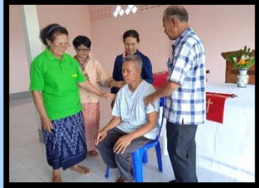
MV Ban Muang Church