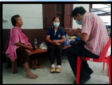
MV Ubon Church