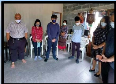
MV Sung Noen Church