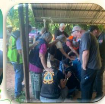
INVOLVE INSPIRE IMPACT